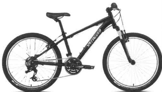
BIKE AND HELMET