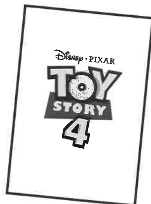
100S OF PASSES TO SEE DISNEY PIXARS "TOY STORY 4"