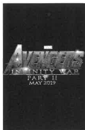
100S OF PASSES TO SEE MARVELS "AVENGERS 4 - INFINITY"

**Entry must be typed and on A4 Paper. Entries will be judged on quality, meaning and creativity. Please ensure the name grade and class are clearly included on both your story and on the official ANZAC Day Initiatives entry form.