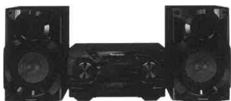
MINI HI FI'S