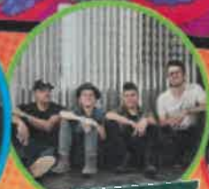
VIPER CREEK BAND